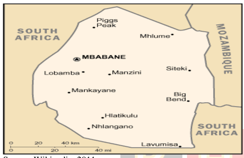
Figure 1: Map of the Kingdom of Swaziland